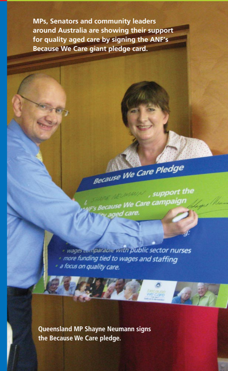
Queensland MP Shayne Neumann signs the Because We Care pledge.

MPs, Senators and community leaders around Australia are showing their support for quality aged care by signing the ANF's Because We Care giant pledge card.